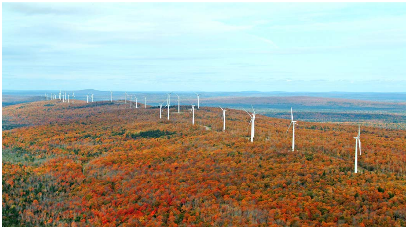
Stetson Wind Farm

In 2010, Maine's wind power facilities reduced global warming pollution by displacing fossil fuel generation (generally natural gas)—by approximately 230,000 tons of CO 2 . 2 This is equivalent to CO 2 pollution from burning 20 million gallons of heating oil, or driving 40,000 average cars in a year.