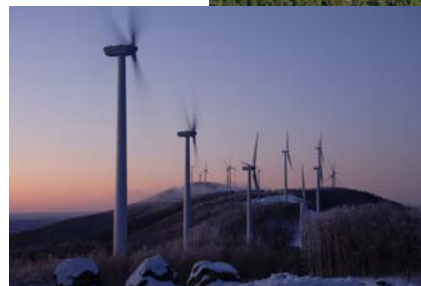
Mars Hill Wind Farm