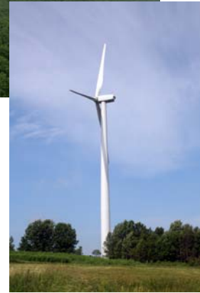
Beaver Ridge Wind Farm