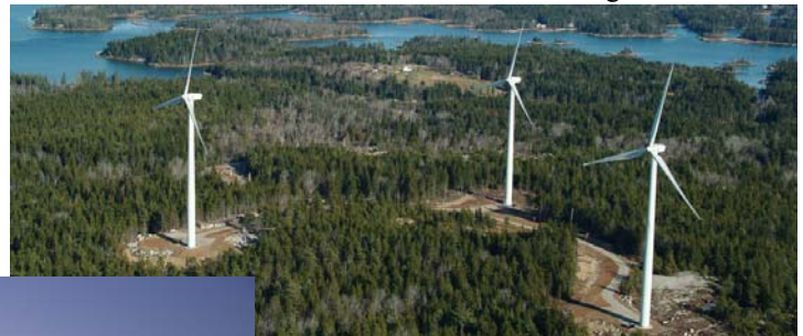
Vinalhaven Wind Farm