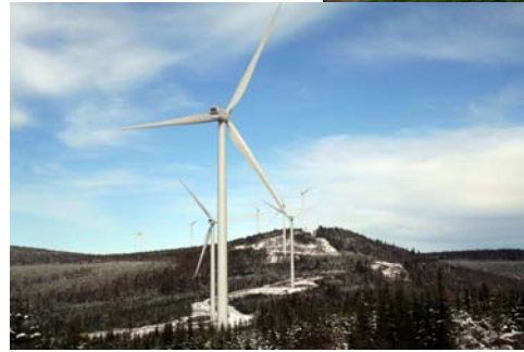
Kibby Wind Farm